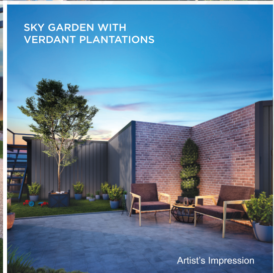
SKY GARDEN WITH VERDANT PLANTATIONS