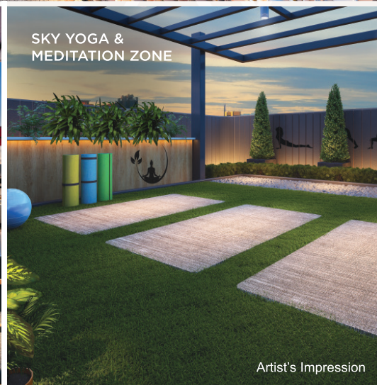
SKY YOGA & MEDITATION ZONE