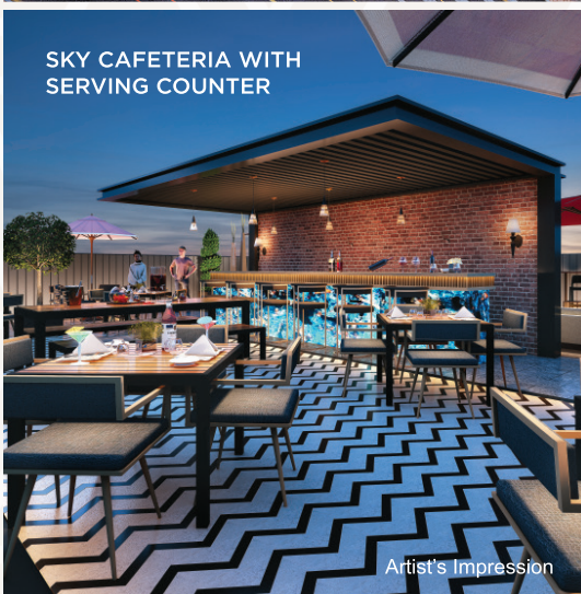
SKY CAFETERIA WITH SERVING COUNTER